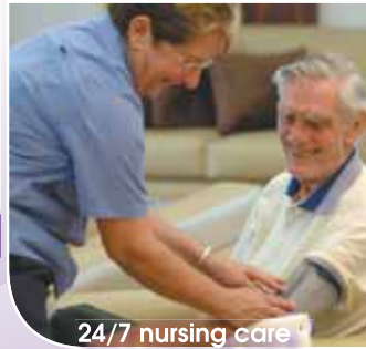
24/7 nursing care